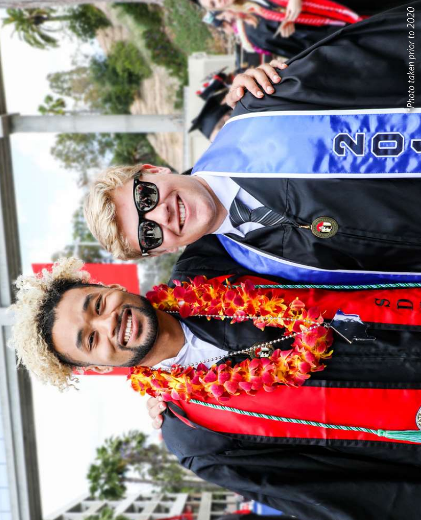
Photo taken prior to 2020.