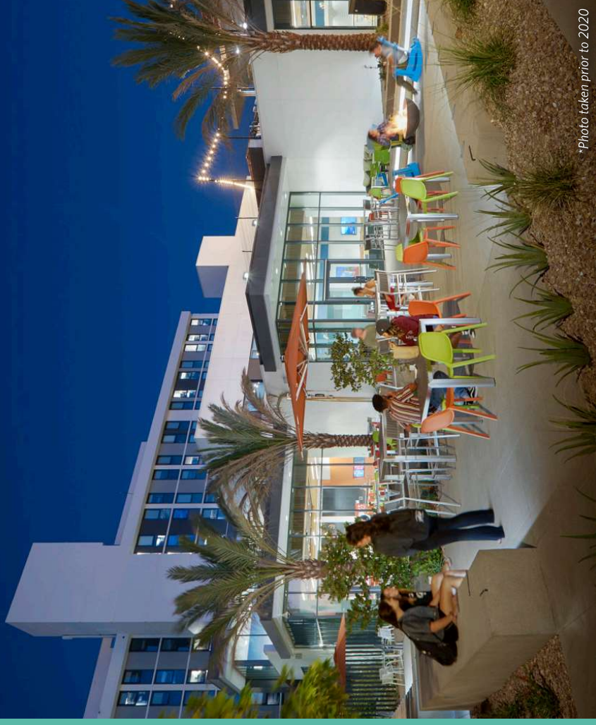
Photo taken prior to 2020

For our first-year students, we typically offer triple occupancy rooms in traditional residence hall buildings (triple occupancy rooms are offline for the 2020-21 academic year due to COVID-19 to ensure social distancing). A limited number of quad, double and single rooms are available based on inventory. Each residence hall includes a 24-hour front desk, recreation room, study room, vending machines, and laundry room. Each room is furnished with a bed, desk, chair, dresser, wardrobe or closet and MicroFridge (microwave, 19 mini-fridge combination unit).