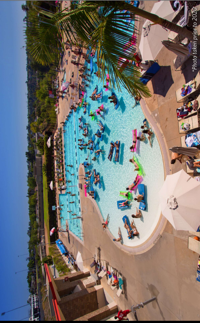
Photo taken prior to 2020