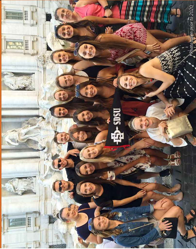
Photo taken prior to 2020.

To read these stories and more, go to research.sdsu.edu/undergrad .