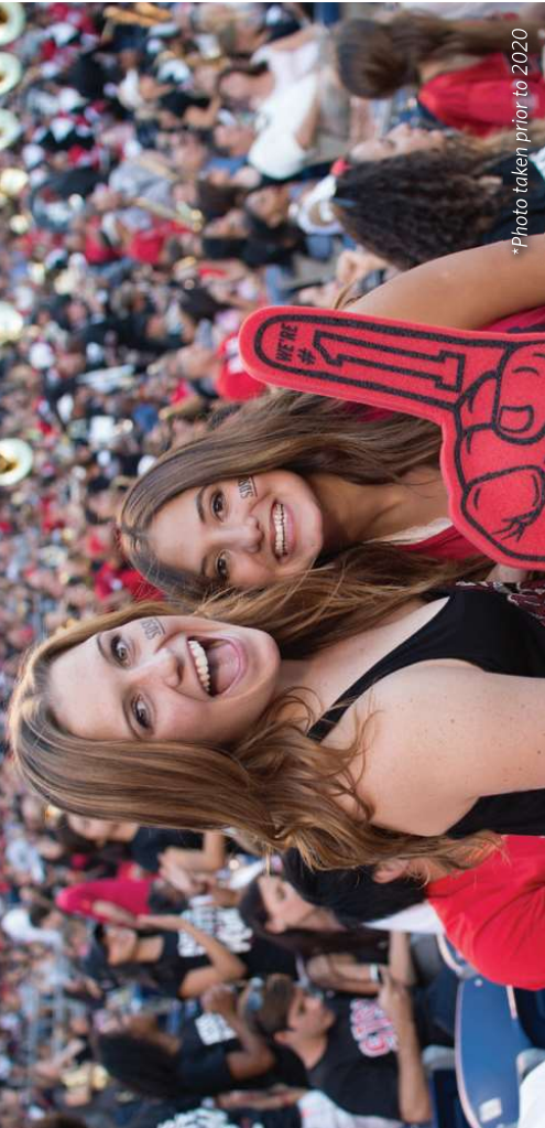
*Photo taken prior to 2020