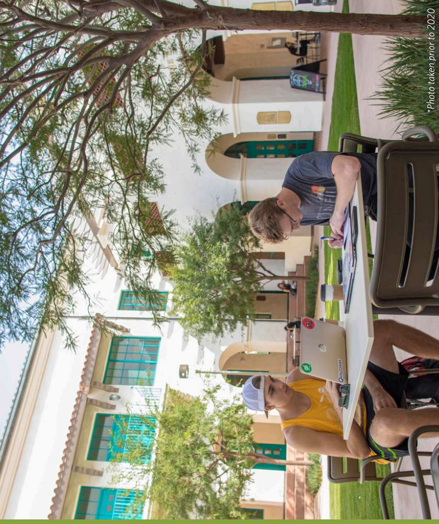
*Photo taken prior to 2020

Cal Grant: California residents may be eligible to receive a Cal Grant, which is free money for college. Apply by submitting the FAFSA ( fafsa.gov ) and the GPA Verification Form ( csac.ca.gov ) by March 2.