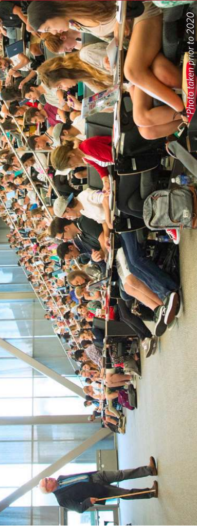
Photo taken prior to 2020