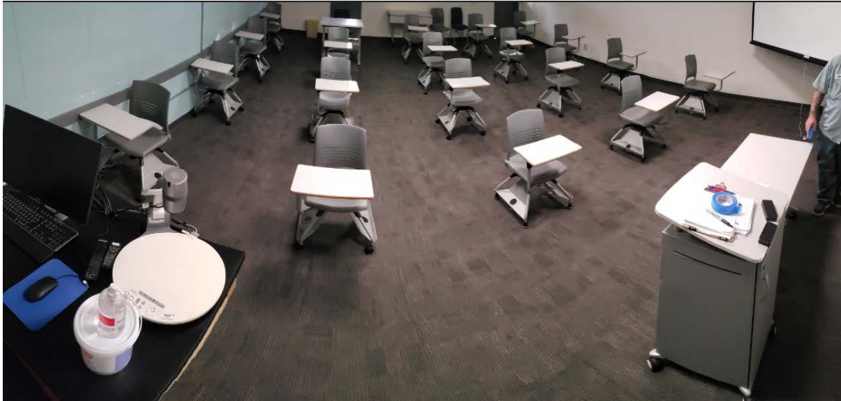
Griffin Gate Chancellor's Cabinet Setup