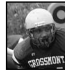
Magnum Mauga Utah State